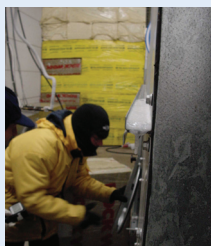
Testing in sub-freezing conditions

That's why BAC is your best partner to replace parts if you want the longest equipment operating life and minimum repetitive downtime .