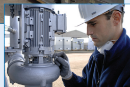
Each BAC part has unique technical specifications