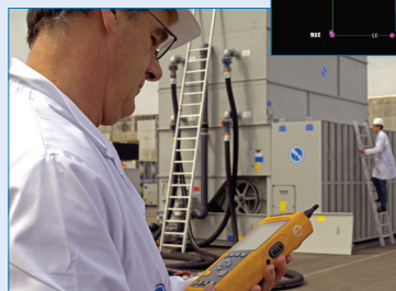
Temperature testing on a cooling tower